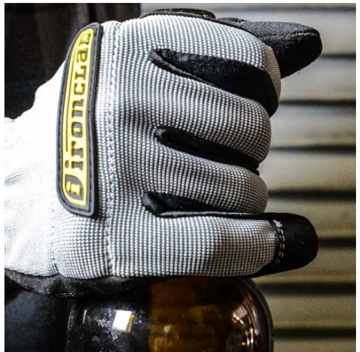
Photos © 2015 Brewers Association. Thanks to Twisted Pine Brewing Co.